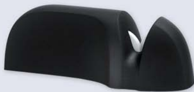
1000 14 cm Messerschärfer // Knife sharpener