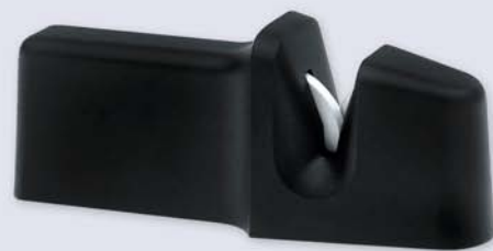
2000 16 cm Messerschärfer // Knife sharpener